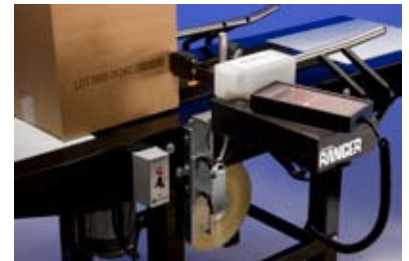
. . . or with Leader's Ranger for printing of bar codes, logos and high resolution alpha- numerics.