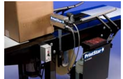
Accurex can be easily integrated with Leader's PrintStar for simple dot matrix case coding. . .