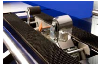
Industrial strength drive belts move boxes consistently through the taper.