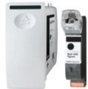
Bulk ink cartridge