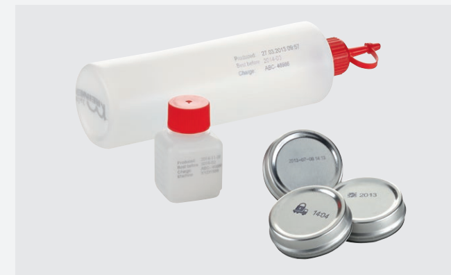
Printing with quick drying ink on metal and plastic (Version MP).